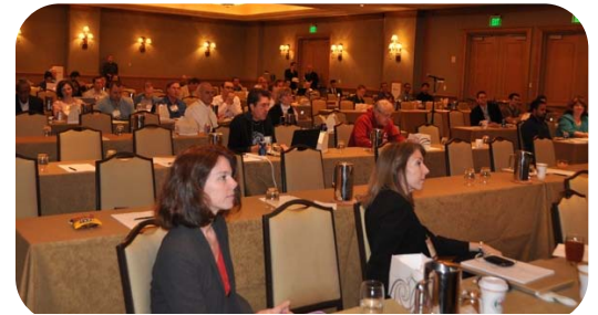
A Riveted Audience