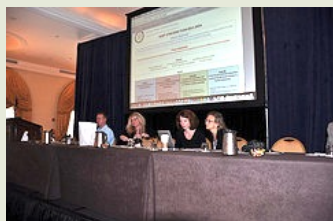
ACMT Board of Directors during Business Meeting