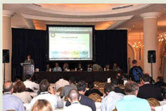
ACMT Business Meeting