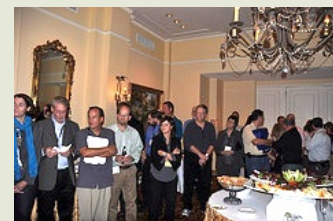
2011 FACMT Reception